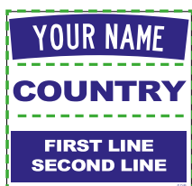
SUGGESTION FOR A NATIONAL BACKNUMBER