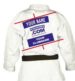
NOT ON A SLANT