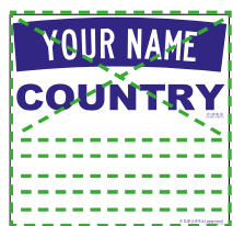
STIPULATIONS FOR IJF/EJU BACKNUMBERS