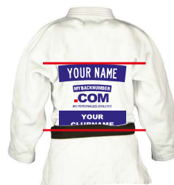
NOT COVERED BY THE BELT